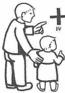
Praying the Stations of the Cross

The Way of the Cross will be prayed on Fridays during lent beginning at 7:00 PM; Mass will follow on the Fridays when there is NO Prairie Villa Mass.