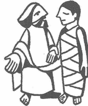
The dead man came out

St. Louis Parish Box 176 Mossbank, Sask. S0H 3G0