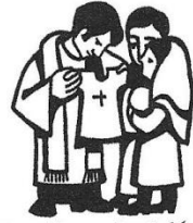
Baptism of children

The annual conference will be held this year in London, Ontario from June 21st to 24th. All Cursillistas are welcome whether active or not. Conferences are a time to go deeper into understanding the Cursillo movement, meet and/or reconnect with friends from across the country and take home a wealth of information to share with your local movements. Ph: CCCC 250 938 4241 or check the website www.cursillo-canada.org .