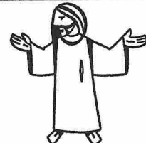
Lord, let your face shine on us