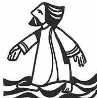
They saw him walking on the water