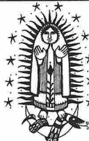
The Assumption August 15