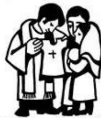
Baptism of Children