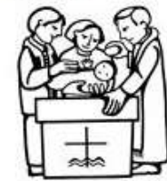
I baptize you in the name of the Father and of the Son and of the Holy Spirit